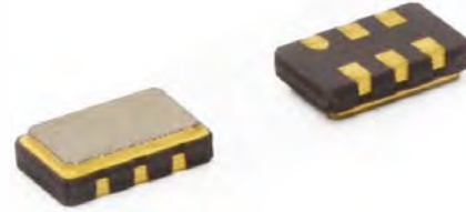
Part Dimensions: 5.0 × 3.2 × 1.2mm • 62.00mg